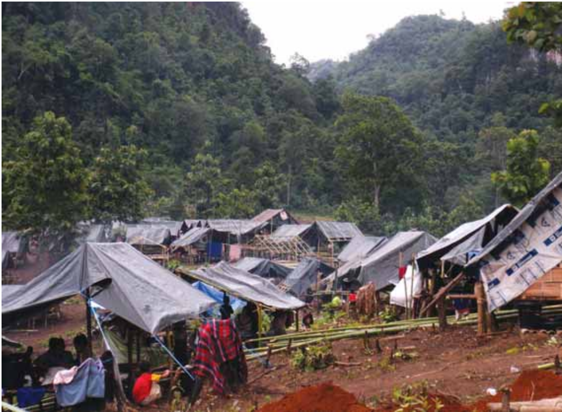
A displaced village in Karen State

This third volume of evidence “Walking Amongst Sharp Knives” builds on the two previous reports. It focuses on the unseen women’s leadership role in the armed conflict area and the persecution suffered by Karen women village chiefs. Nearly 100 cases of the persecution of women village chiefs from 1982 until 2009 were documented by the KWO.